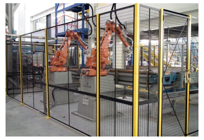
Fig. 2: Along with the robots, Automacad delivers a custom risk assessment solution which includes safety sensors and fences to guarantee your employees' safety around the robots.