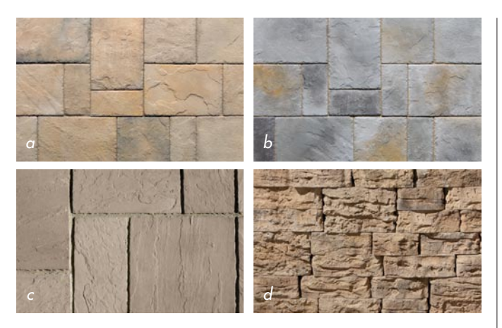
Fig. 3a,b,c,d: Examples of product finishes obtained with the Color-I colouration robot.

Going even a step further in saving producers money, the robot's unmatched functionality gives it the ability to spray diagonally onto the moulds' inside walls, what this means is that producers can program any one of the spray guns to function as a release agent applicator. In other words, it means combining both processes onto a single piece of equipment and completely eliminating the need to otherwise require a separate release agent application station, whether manual or automatic.