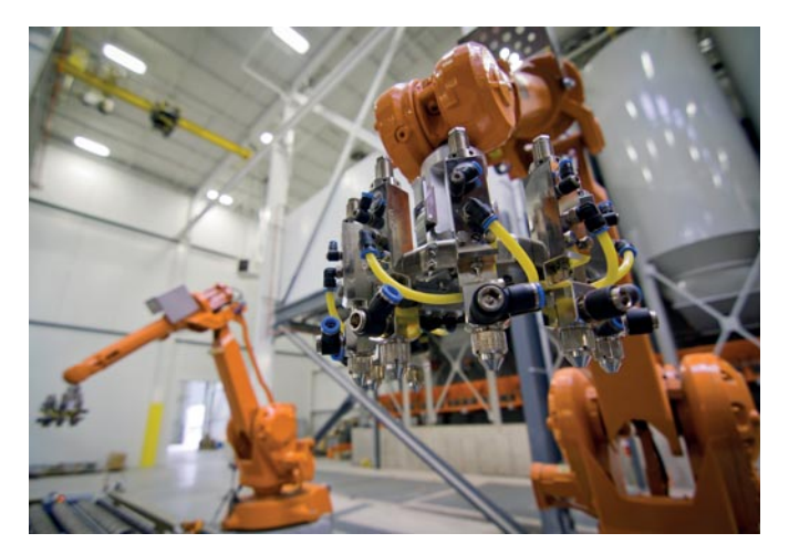
Fig. 1: Two Automacad Color-I colour application robots have the combined capacity to deliver up-to 16 colours for unlimited colouration patterns and non-repetitive effects. The robots apply colour directly inside the mould cavity, just prior to the filling process.

The robot, as its nature suggests, works at a very high level of accuracy and execution precision, therefore, substantially prolonging the moulds' lifetime by keeping them clean time after time as well as allowing producers to significantly reduce their paint costs by minimizing paint wastage.